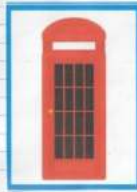
This is red telephone box