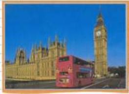
This is the Houses of Parliament and Big Ben.