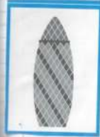
This is called the Gherkin.