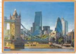
This is tower Bridge