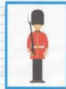
This is a guard that protects the palace.