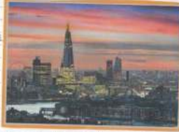
This is the tallest building in London. It's called the Shard.