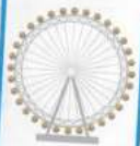
This is the London eye