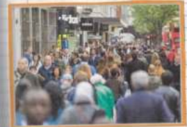
London is a very busy place.