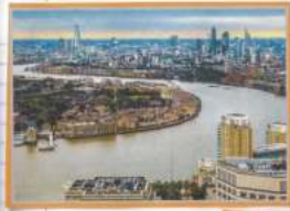
This shows the River Thames.