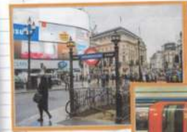
This is the London underground.