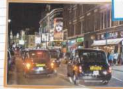
This is London famous taxi. Know as the black cab.