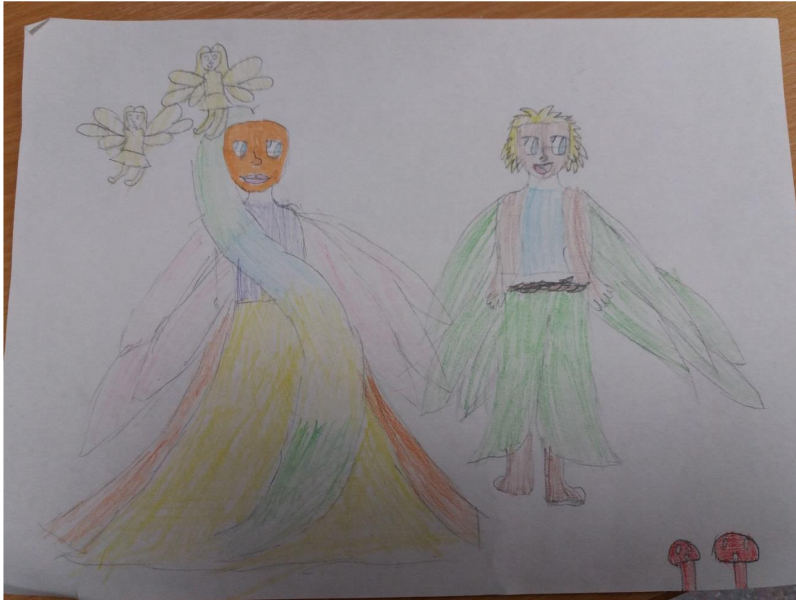
Rainbow Oberon and Titania